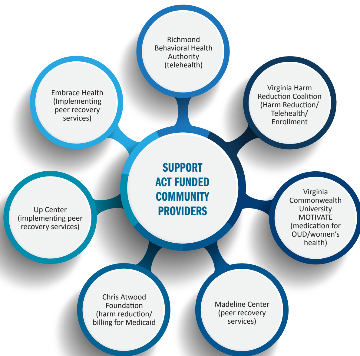
Figure 4: SUPPORT Act Funded Community Providers