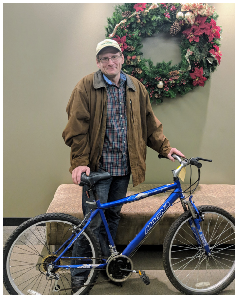
SPNS intervention participants