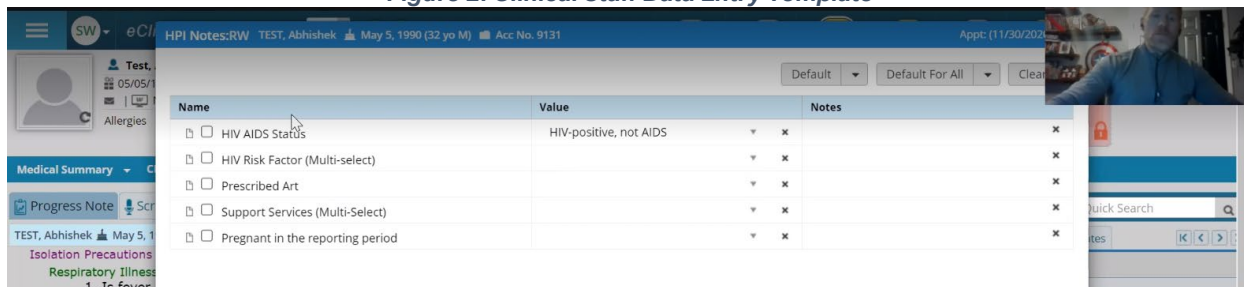
Figure 2: Clinical Staff Data Entry Template