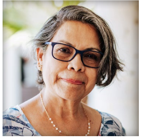
Peer Linkage and Re-engagement of Women of Color with HIV

DISSEMINATION OF EVIDENCE INFORMED INTERVENTIONS