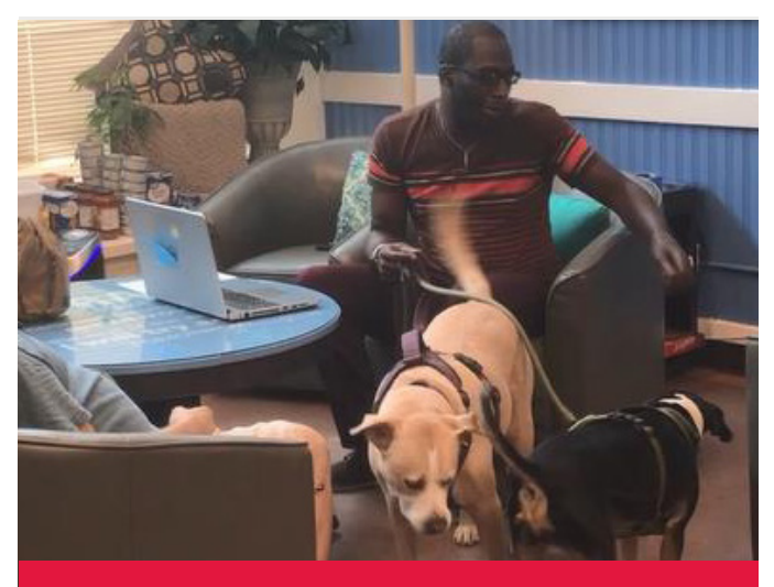
POWER graduate bringing his pets to the POWER space