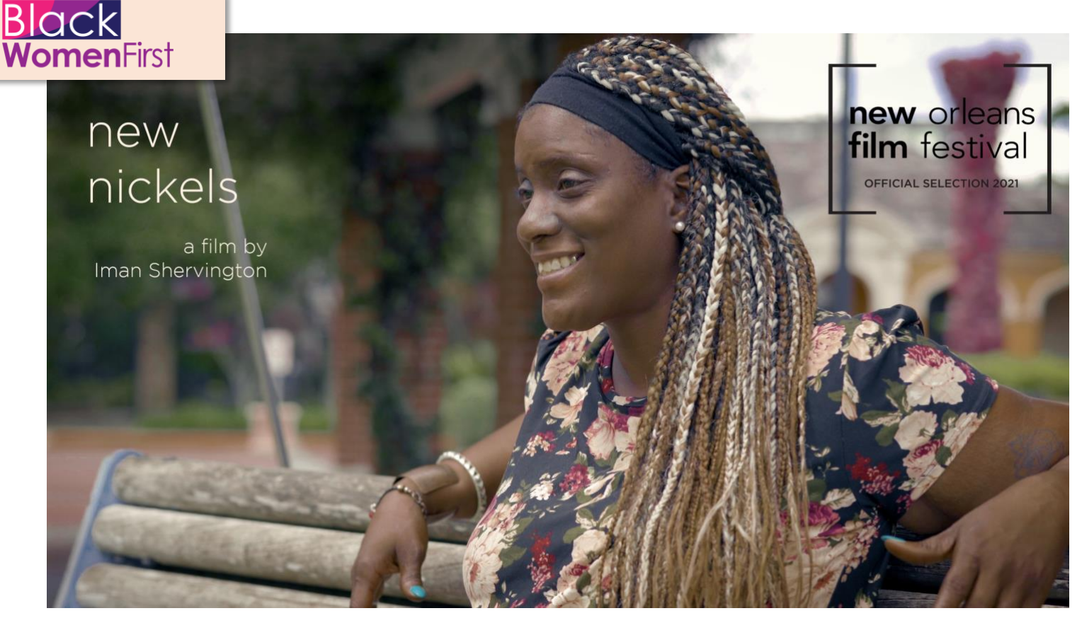
Figure 2 Image shared and printed with permission by Iman Shervington.