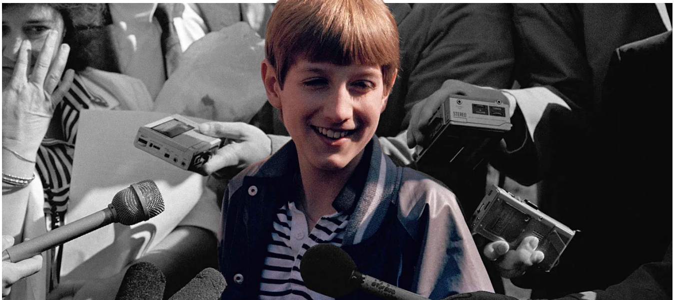
Ryan White and his mother, Jeanne White-Ginder (left), with reporters after a judge threw out a temporary injunction that barred him from attending classes at Western Middle School in Russiaville, Indiana, 1986.

..... HRSA's Ryan White HIV/AIDS Program (RWHAP) is named for a courageous young man who was diagnosed with AIDS in December 1984, when he was 13 years old and living in Kokomo, Indiana. He was given six months to live. When he tried to return to school, he fought AIDS-related discrimination. Along with his mother, Jeanne White-Ginder, Ryan White rallied for his right to attend school, gained national attention, and became the face of AIDS. Surprising his doctors, Ryan White lived five years longer than predicted. He died in April 1990, one month before his high school graduation and only months before Congress passed the legislation bearing his name in August 1990: the Ryan White Comprehensive AIDS Resources Emergency (CARE) Act.