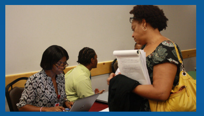
Working with clients to verify and maximize benefits

Broward Community & Family Health Centers, Inc. (BCFHC)